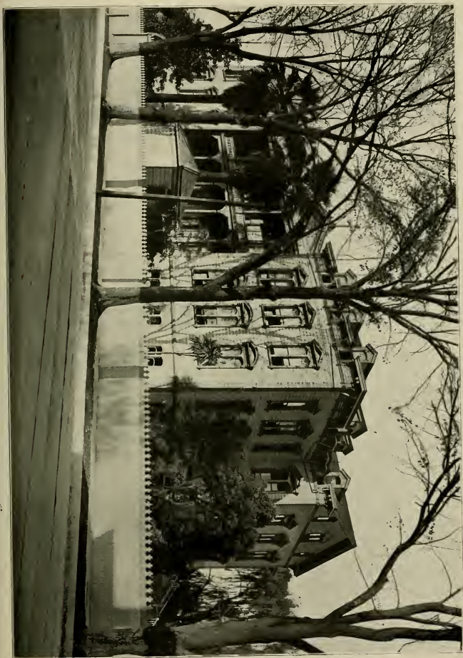
ST. JOSEPH'S ACADEMY